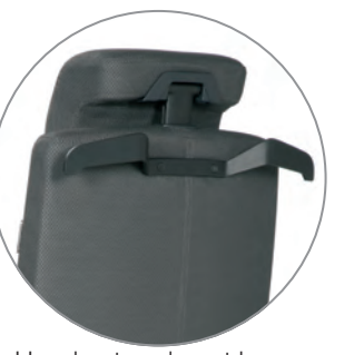
Headrest and coat hanger

can be optionally upgraded with the following: