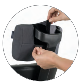
Headrest protective cover

can be optionally upgraded with the following: