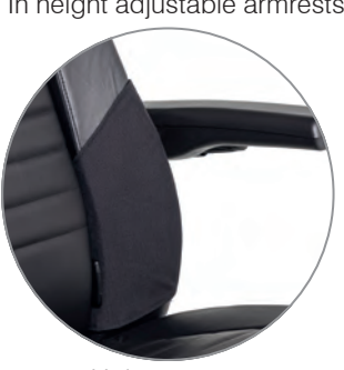
Holster protect (fabric / leather protection)