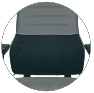
Holster protect (fabric / leather protection)