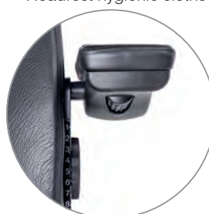
In height adjustable armrests